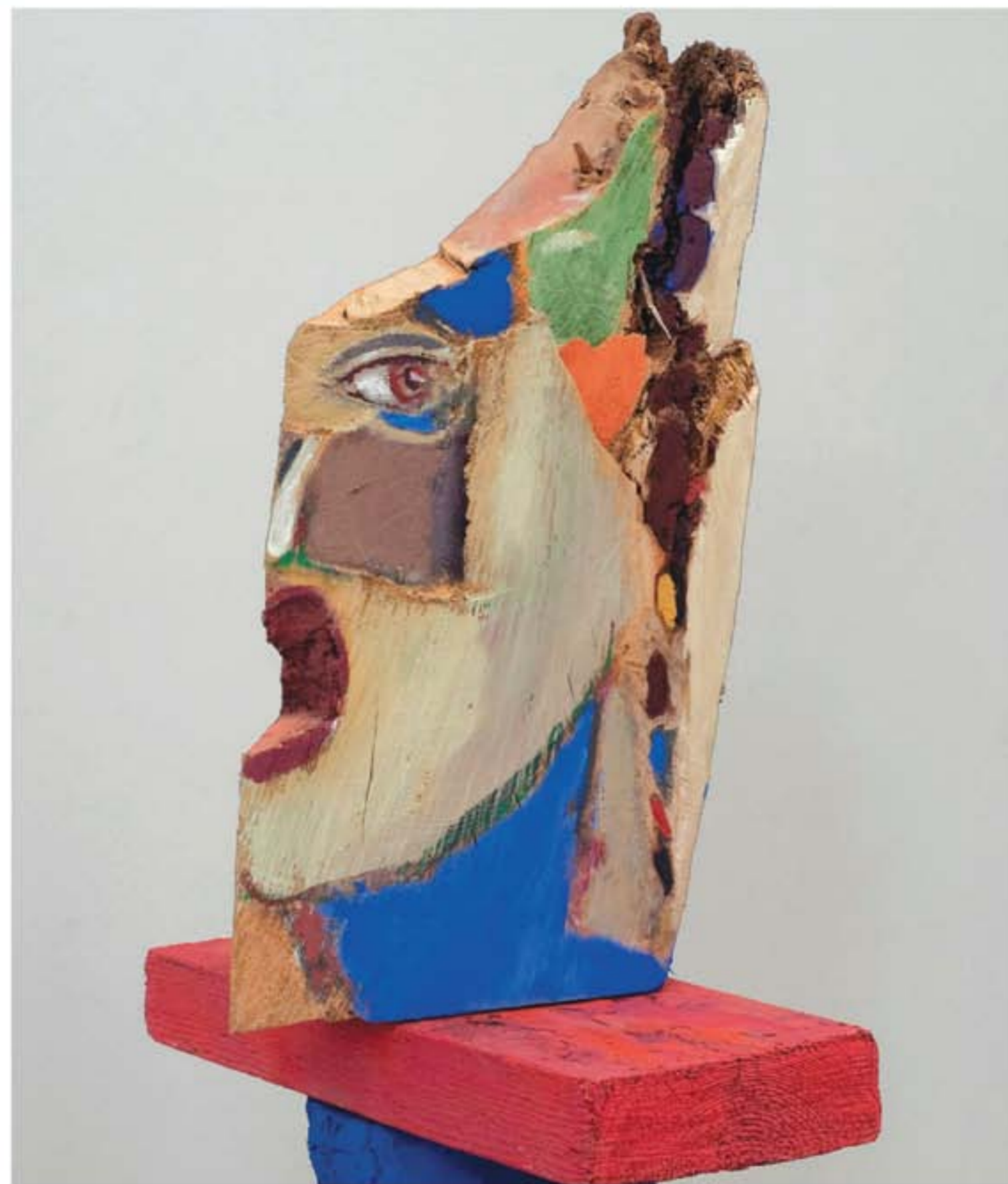
Detail, Lys Hansen: Blue Neck with Red, from the exhibition 'Across the Divide' at the Murray Edwards College, Huntingdon Road, Cambridge, until May 25

Number 173 Pick up your own FREE copy and find out what's really happening in the arts May/June 2012