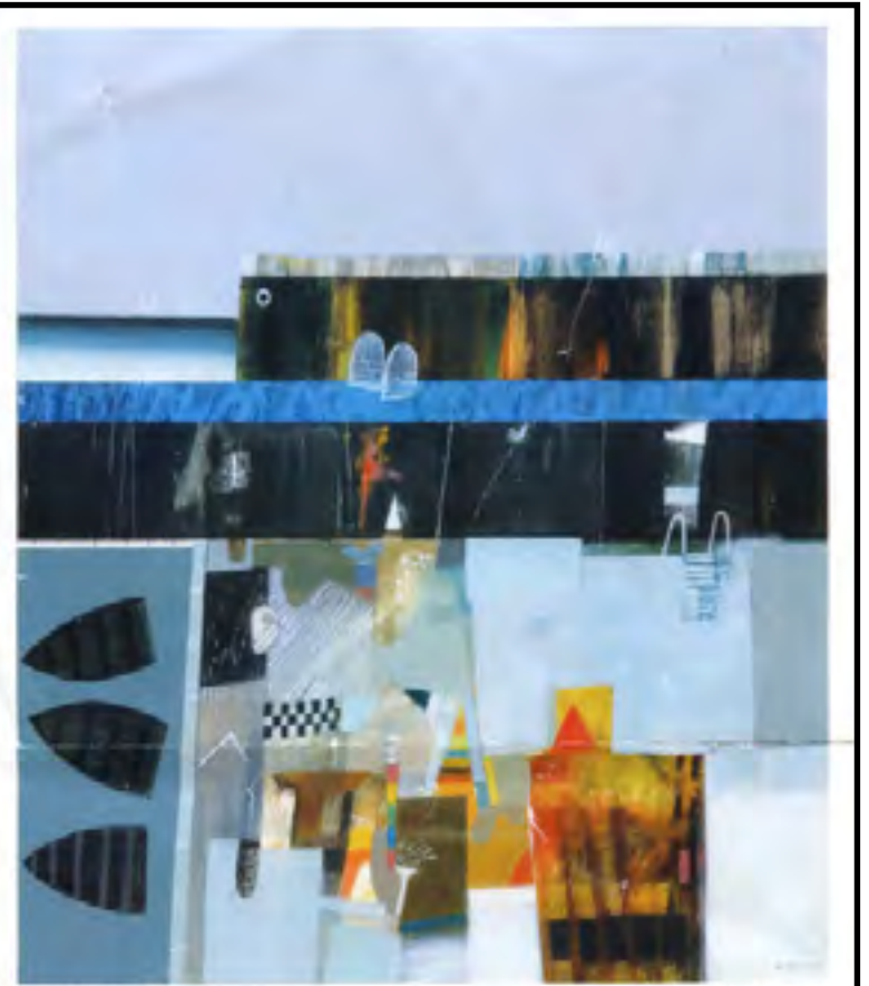
Harbour and Pool, Fife Archibald Dunbar McIntosh RSW RGI