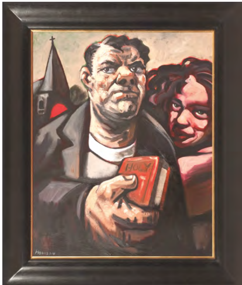
Left: Holy Willie, Peter Howson - Right: John Byrne

The Scottish Contemporary Art Auctions are staged by McTear's in Glasgow every five weeks