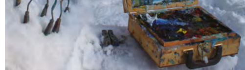
Knives (and trowels) at the ready in 'Solitude' at Aberdeen Art Gallery, marked her 80th birthday.