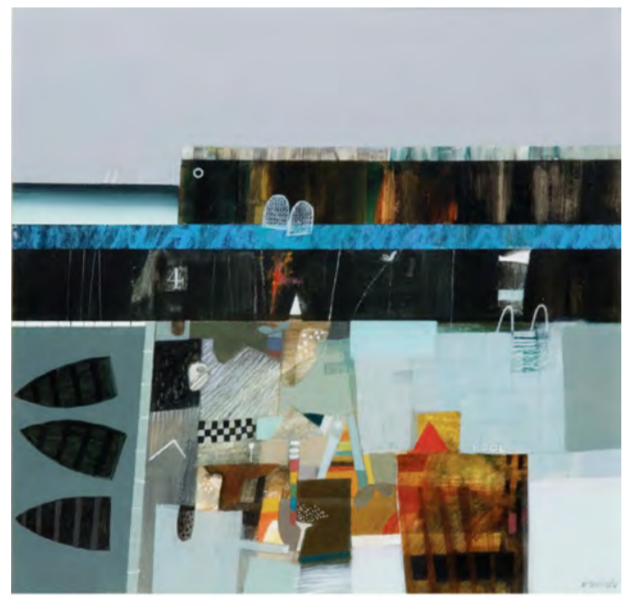
Harbour and Pool, Fife Archibald Dunbar McIntosh RSW RGI