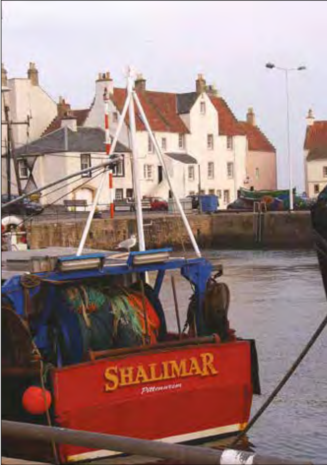
Pittenweem – home of the celebrated Pittenweem arts festival

Kirkcudbright is no slouch when it comes to staging artistic events. Its thirteenth Arts & Crafts Trail this year runs from July