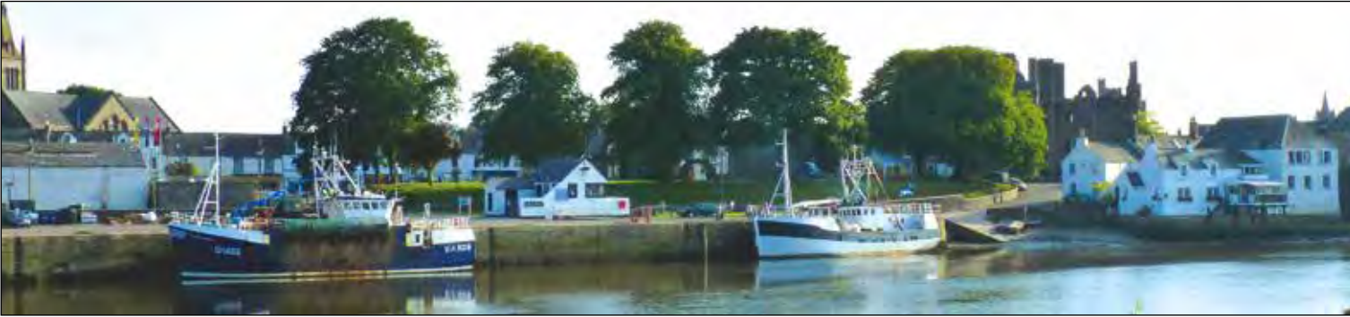
Kirkcudbright-sur-mer, with the Harbour Gallery right in the picture (in front of the castle), and below