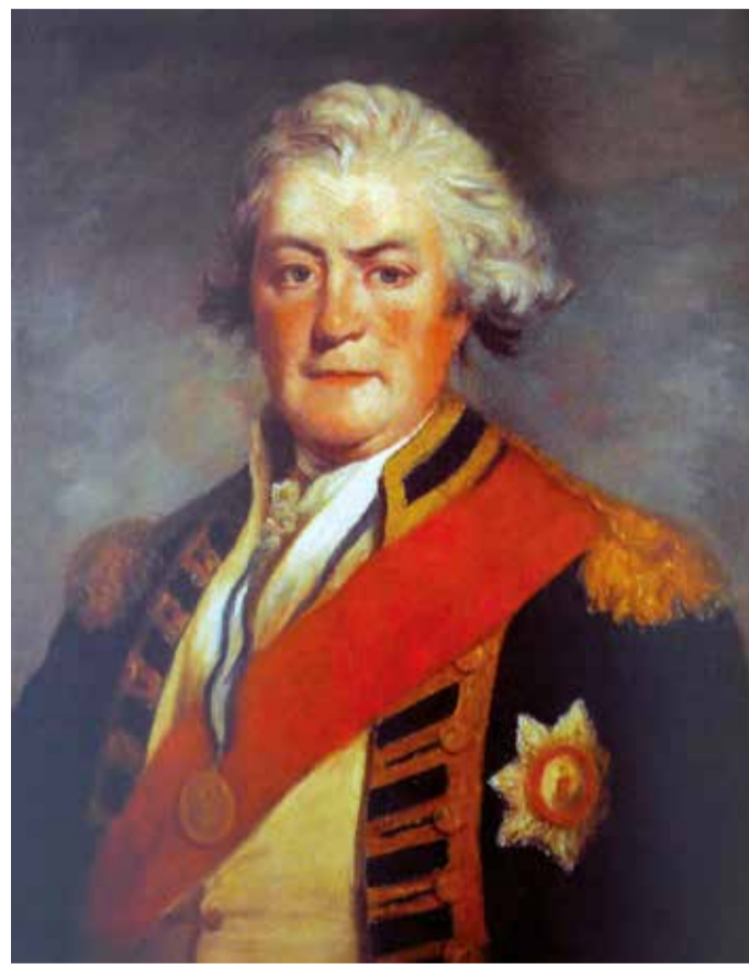
Admiral Lord Duncan – victor of Camperdown

in and saved the house for the nation. His own contribution is believed to be £20m.