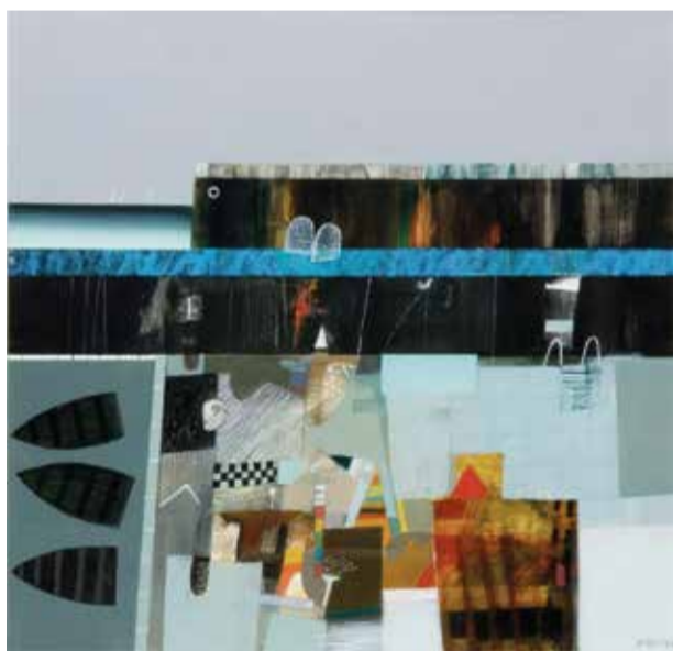
Harbour and Pool, Fife Archibald Dunbar McIntosh RSW RGI