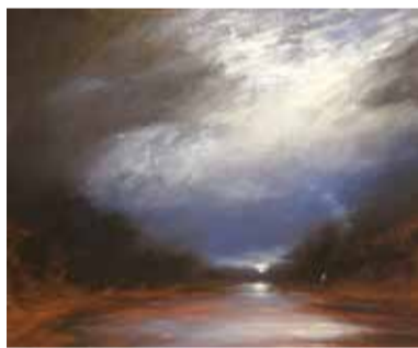
Ian Shields (left)