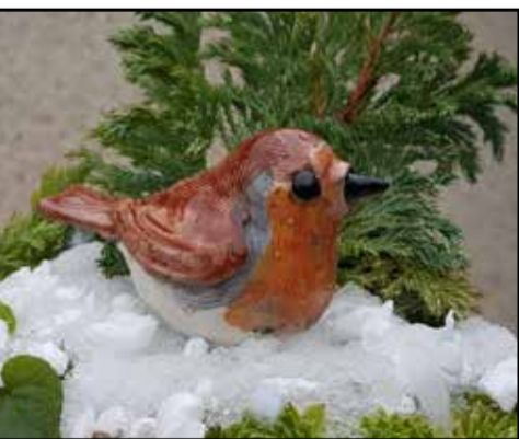
LESLIE D MCKENZIE "Robin" - ceramic, c.10cm

Thistle Street, Aberdeen AB10 1XD 01463 24 625629 E: info@galleryheinzel.com W: www.galleryheinzel.com