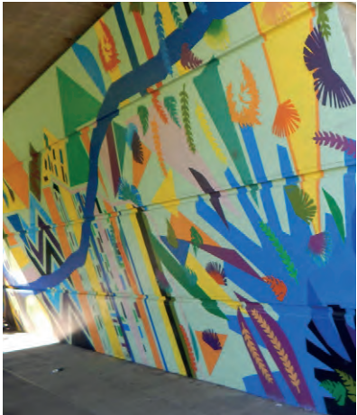
Officially sanctioned graffiti in Livingston