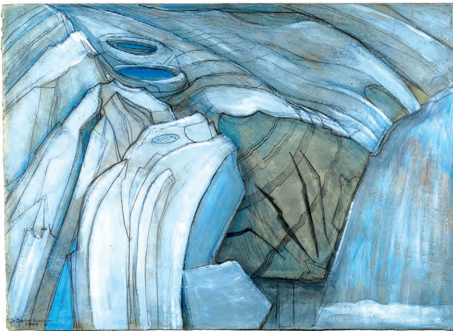
End of the Glacier Upper Grindelwald, 1949, gouache and pencil on paper © WBGT

Brought up in Fife in 1912, 'Willie', as she was affectionately known, having studied in Edinburgh, went to St Ives in 1940 to breathe in its rich cultural buzz, the fresh Atlantic air, (she had a weak chest), and the light.