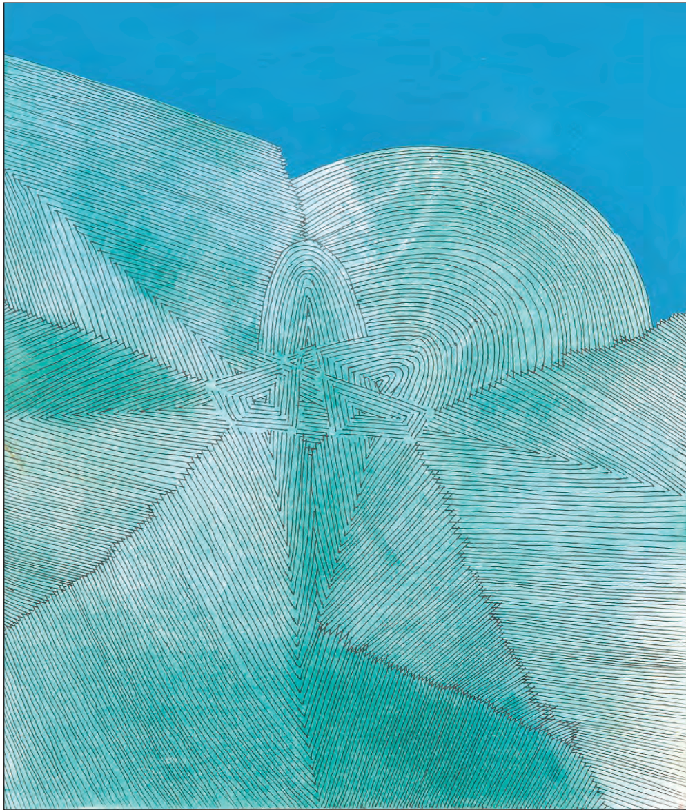
Glacier Knot, 1978, pen, ink and mixed media on paper.

Trust that this exhibition has opened in Berwick.