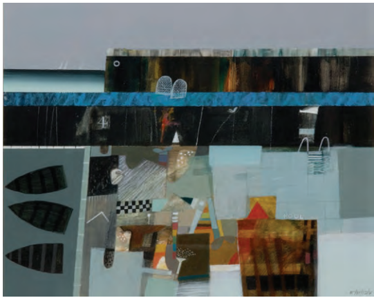
Harbour and Pool, Fife Archibald Dunbar McIntosh RSW RGI