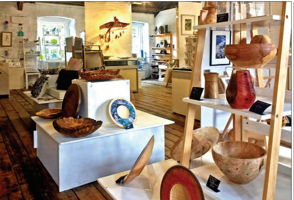
Popping up in Gatehouse of Fleet