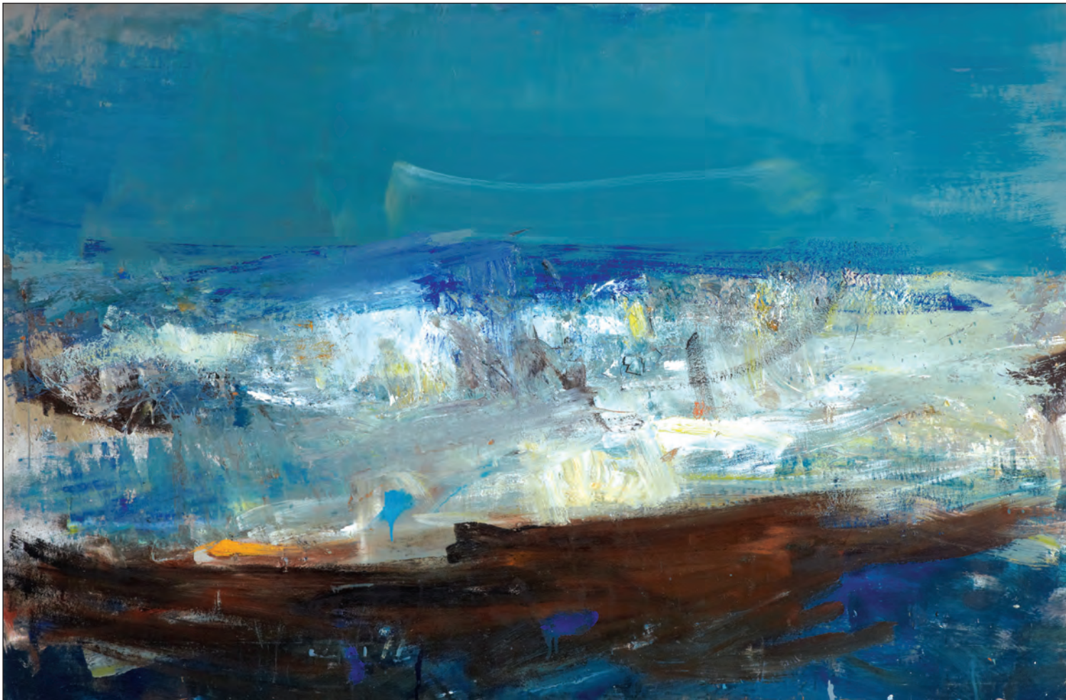
Joan Eardley, Summer Sea, Oil on board. (c1960-c1963).

Her words. Her special talent? The ability to express that primeval en-